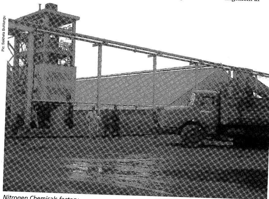
Nitrogen Chemicals factory.

□ A number of militant standoffs have occurred. In March 1996, three senior managers at Hybrid Poultry Farm in Lusaka were nearly lynched by 200 irate workers striking against their alleged mismanagement and bad attitude towards workers. The workers were members of the National Union of Plantation and Agricultural Workers (NUPAW). In October, the Managing Director of the Medical Stores narrowly